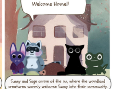
Sage offers Sunny a place to stay at his inn, where various woodland creatures have gathered.