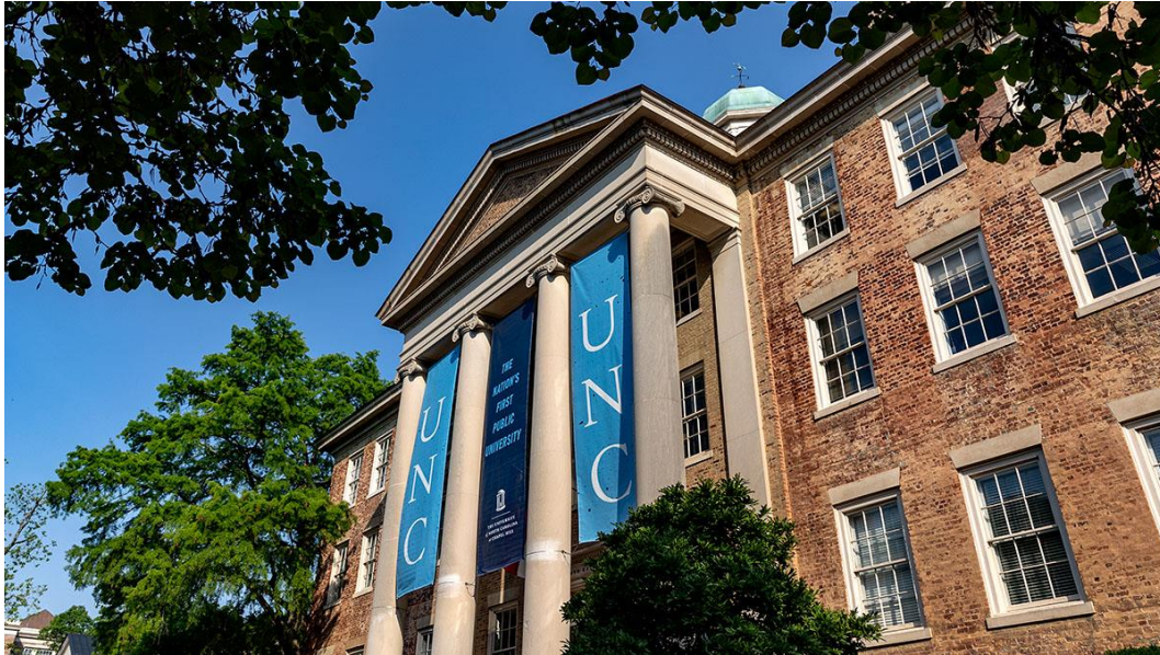
Photo of South Building